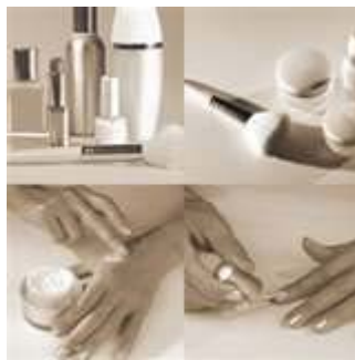
Figure 5-Possible irritants for allergic contact dermatitis

for contact dermatitis is avoidance of the chemical exposure.