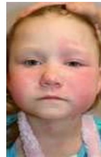
Figure 1 - Allergic contact dermatitis - Paraben mix in sunscreen