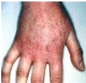
Figure 2-Irritant contact dermatitis

hand has a limited number of allergenic chemicals known to be capable of eliciting an immune response. The most common causes of ACD in the United States include plants of the Rhus genus (poison ivy, poison oak, poison sumac), nickel (metal snaps on clothing and jewelry), and rubber compounds (as in latex products for example). TABLE 2 lists some common allergenic chemicals.